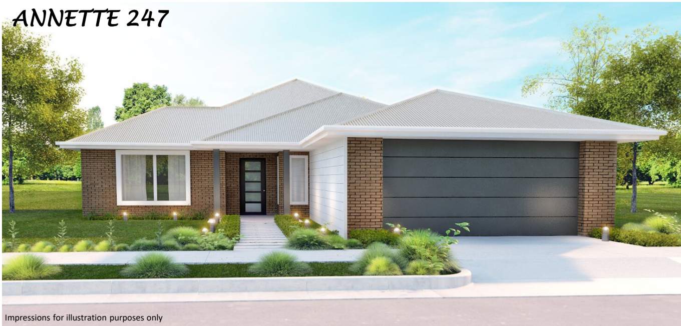
Impressions for illustration purposes only