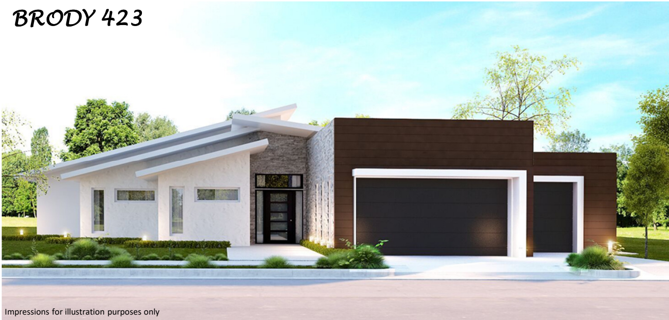
Impressions for illustration purposes only