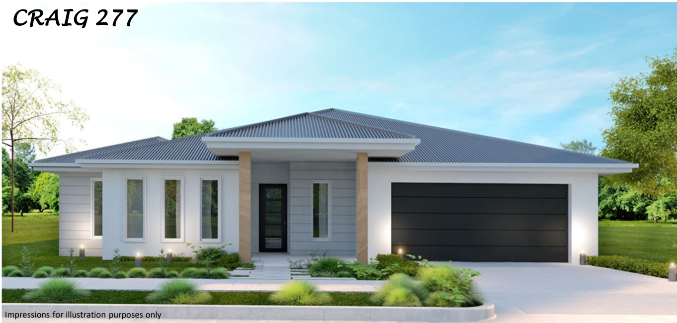
Impressions for illustration purposes only