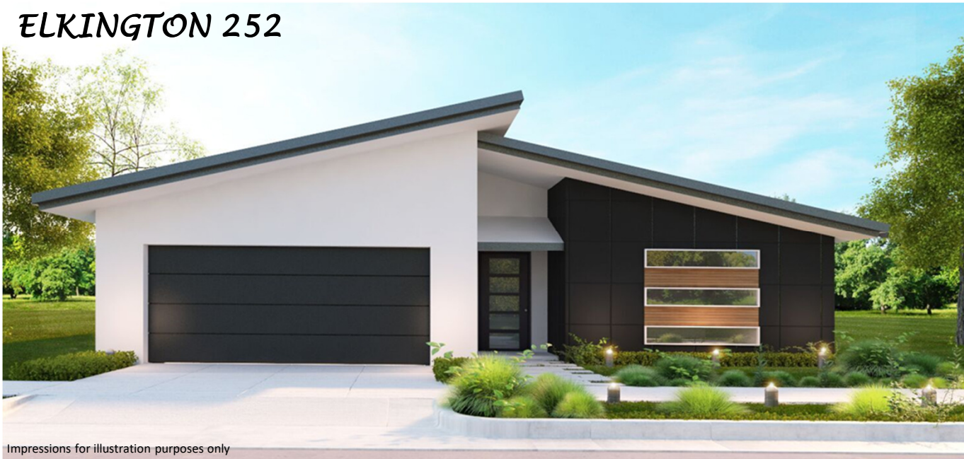
Impressions for illustration purposes only