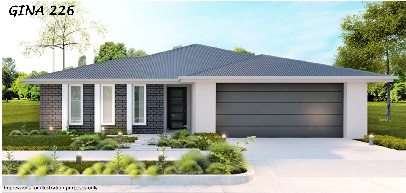
Impressions for illustration purposes only