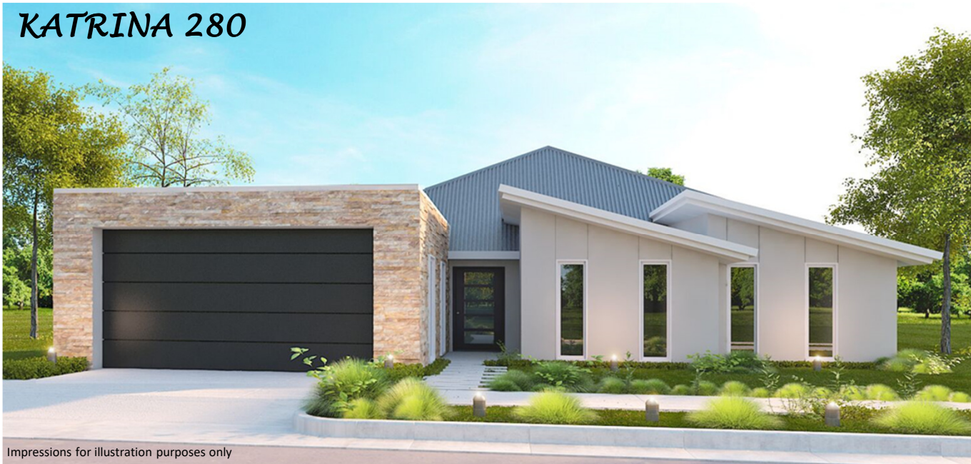
Impressions for illustration purposes only