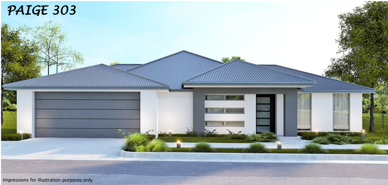
Impressions for illustration purposes only