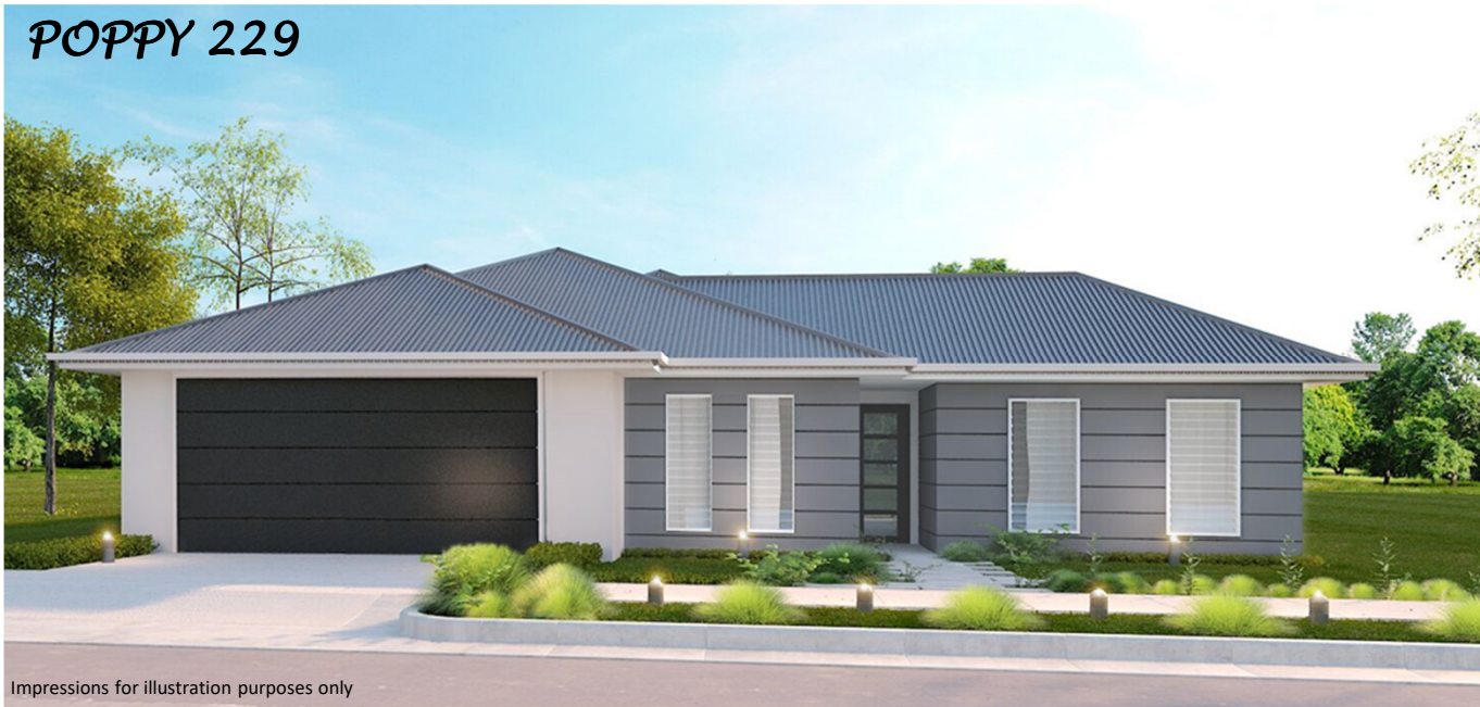
Impressions for illustration purposes only