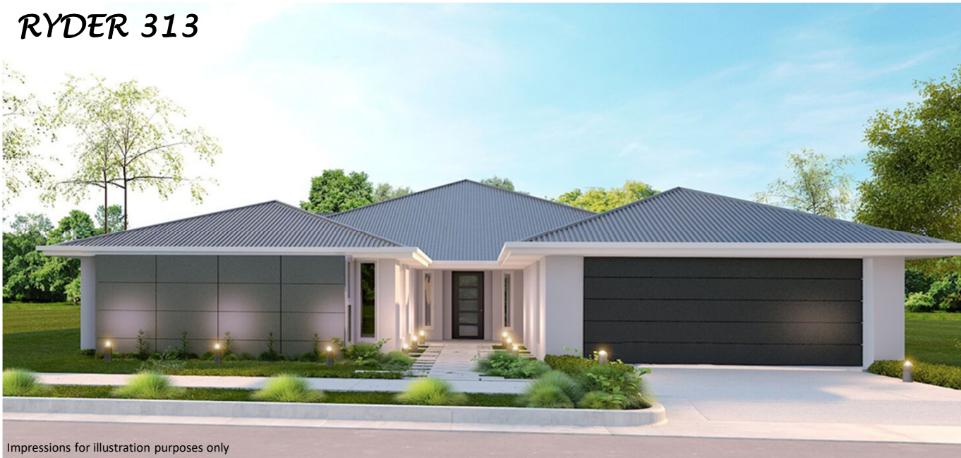
Impressions for illustration purposes only