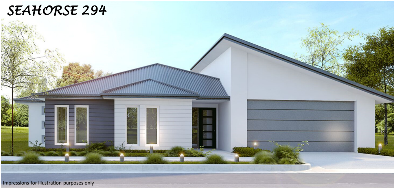
Impressions for illustration purposes only