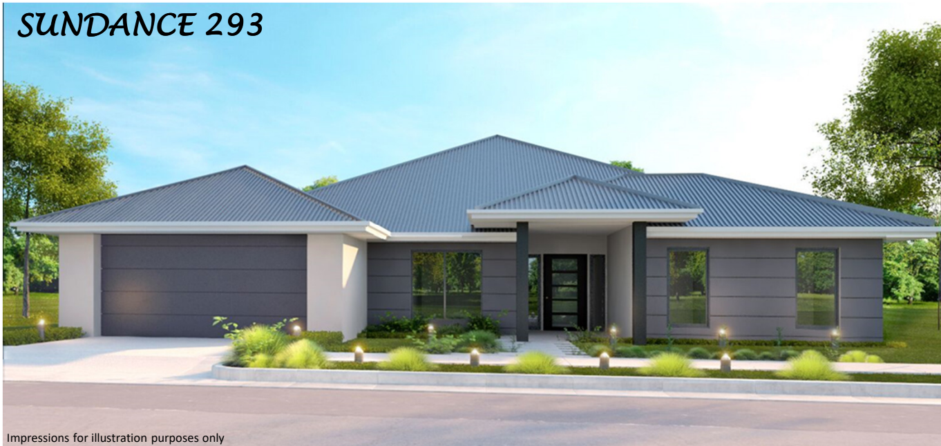
Impressions for illustration purposes only