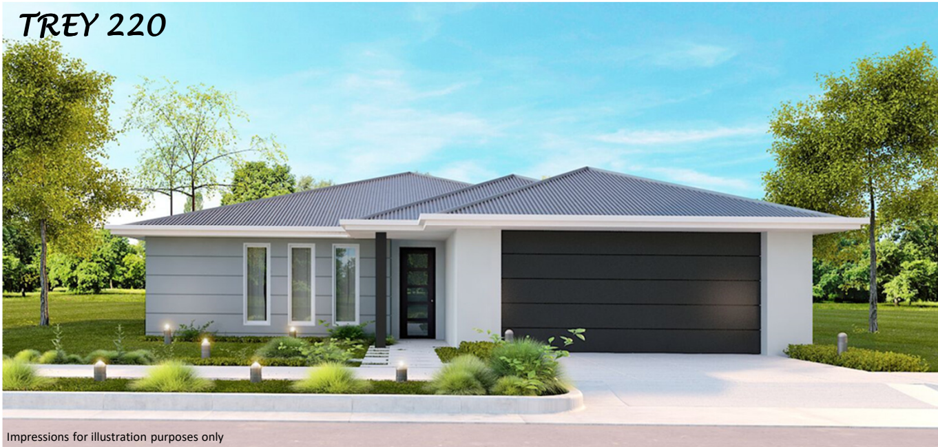
Impressions for illustration purposes only