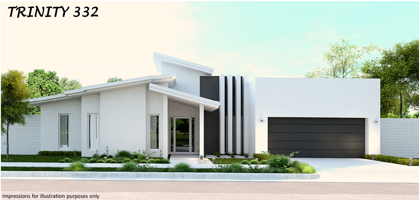
Impressions for illustration purposes only